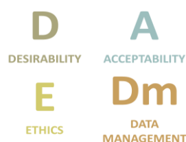
Figure 1. The four pillars of a Societal Impact Assessment

Societal impact assessment is the evaluation of the risks, externalities and consequences of technologies, policies, programs, and systems. As a result, it must account for a wide range of concerns and stakeholders. Eticas’ methodology first main contribution is to suggest a four-part approach to SIA that can help to assess data-intensive technology used for security. This framework includes many of the terms and concerns included in previous methodologies, but give them coherence, adapt them to the challenges of new technological developments (such as Big Data) and puts forward a specific assessment method to guide decision-making. The framework is based on four main pillars that combine technological policy and sociological perspectives and inputs: desirability, acceptability, ethics, and data management, and provides a means of operationalizing assessment of security technologies to anticipate and compare a range of economic, data and values impacts for various stakeholders (see Figure 1).