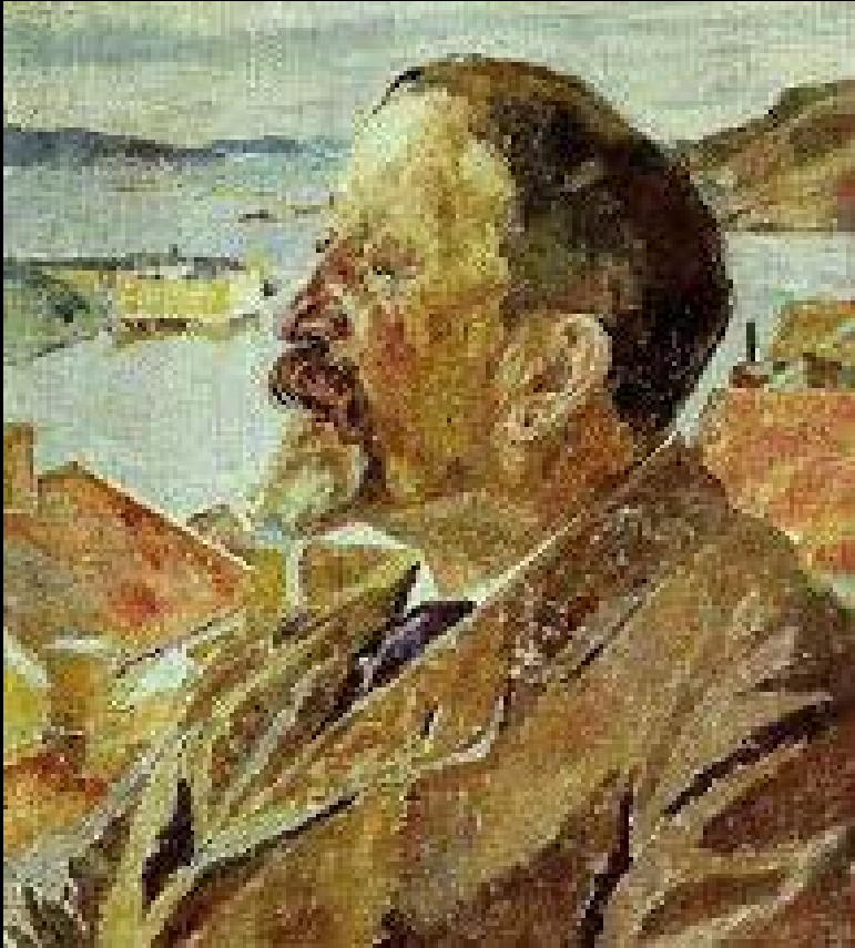
Hjalmar Lundbohm founder of The City of Kiruna